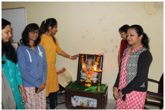
(A) Inaugural Prathana